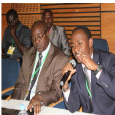
Directors of Agriculture of the ECOWAS and UEMOA Commissions