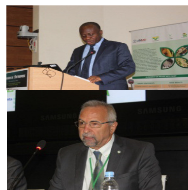
AfDB, USAID/WA and the World Bank were at the Launching