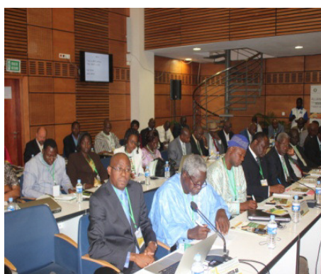
A cross-section of participants at the COASem-CRSU Launching