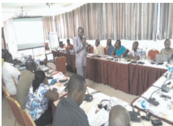
Training on Seed Quality Control & Certification, in Guinea Bissau