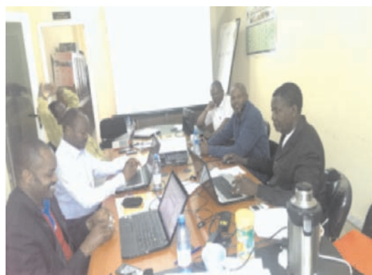
IT Data Management training for three (03) Catalogue Managers from Benin, in Bamako